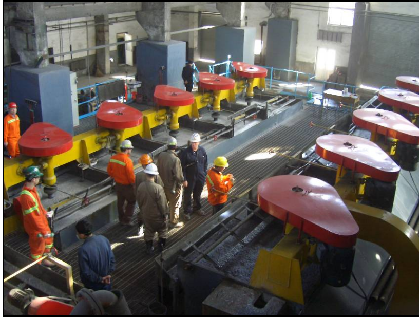
Figure 2 - Rougher Flotation Cells at Jiajia Milling Operation

The concentrate from the rougher circuit was then sent to the regrind cyclopack where the overflow would report to the cleaner flotation circuit and the underflow would go to the regrind mill in attempt to liberate the pyrite from the gangue particles. The regrind discharge would then be sent back to the regrind cyclones to undergo size classification once more before proceeding to the cleaner circuit.