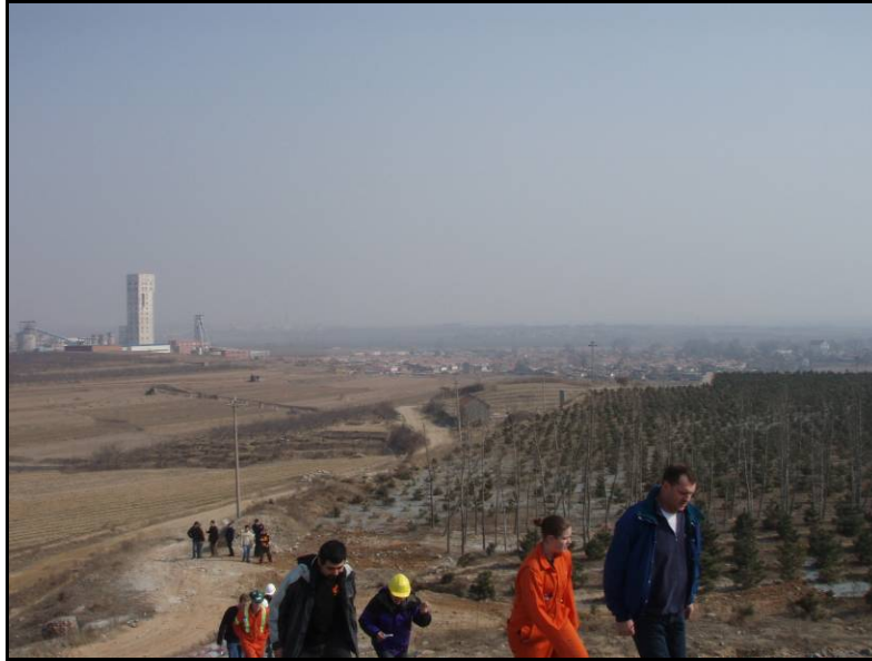
Figure 6 - View from Tailings Dam of Reclaimed Area, Mine and Village

The MIC Biogold plant was the best display of advanced technologies and sciences seen during the China tours. The presentations and tours given were thorough in all explanations of the process and the environmental awareness; it was more than just claims. There was a zero discharge policy on site, due to government regulations regarding cyanide discharge. To avoid the use of expensive equipment to remove any cyanide from discharge water, the plant reuses the solution. Nonetheless, the plant was admittedly worried about thiocyanate and some other metals. During the process, sulphuric acid is created when the bacteria eat the sulphur. To neutralize this, the plant introduces lime to bring up the pH. By neutralizing this material, the plant ensures that there is minimal environmental hazard potential.