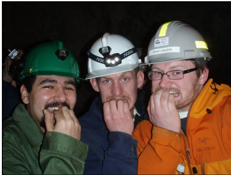
Figure 5 - Impressions of Underground Workings at the Tarzan Gold Mine

The safety record of China's mining industry is well known to be less than satisfactory. While a vast majority of the negative press is given to coal mines in other parts of the country, the statistics still indicate that as a whole, mine safety in China is far behind that of western nations. As a result, having a firsthand look at the safety policies of the Chinese mines we visited was one of the most anticipated and dreaded parts of our trip.