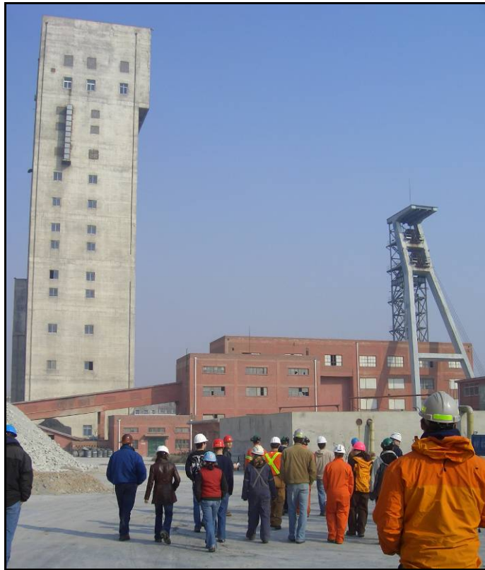
Figure 1 - Yingezhaug Headframe

The Yingezhaug Gold mine is classified as a low grade ore deposit with an average grade of 2.5g/t that is uniform throughout the ore body with a current reserve of 20 million tons. The only access to the underground workings is a single shaft that currently extends to 630m below surface. The head frame is 76m in height, and can be seen in Figure 1 below.